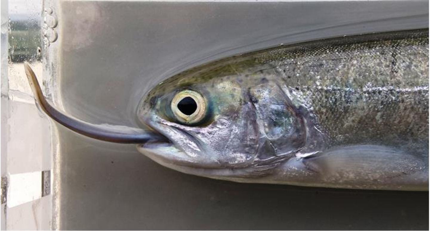
Example of Steelhead ( O. mykiss ), predation upon juvenile lamprey, similar to one sampled on 21 May, 2024 at Bonneville SMF.